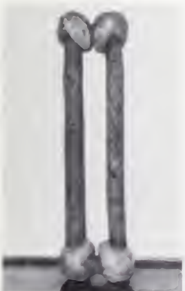
Jackie Winsor, Bum , 1978

Post Modernism's first and most forceful application occurred in relationship to architecture, which had much earlier reached an ultimate stage of formal reduction. The initial manifestations of Post-Minimalism—the term more frequently applied to painting and sculpture—may be seen in the sculpture of Jackie Winsor, John Duff, Keith Sonnier, Alan Saret, and Lynda Benglis. Creating highly idiosyncratic, hand made, non-objective objects, all make very basic statements in their chosen materials. Winsor applies her own labor-intensive craft to the fabrication of stark, geometric objects, which are at once